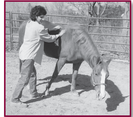
Oh yeah, that's the spot