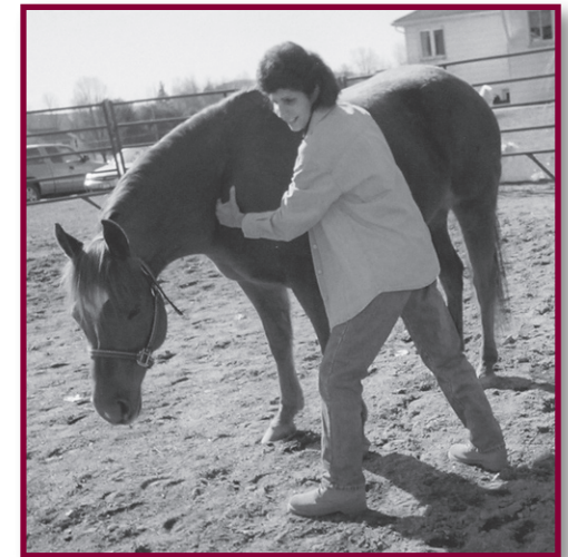
This is heaven