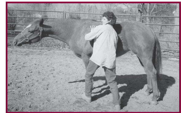
Life is good